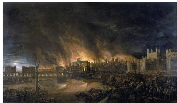
Painting of the Great Fire of London (artist unknown)

This nursery rhyme has lyrics that are sometimes called Scotland's Burning or London's Burning. The Scottish lyrics are about the Burning of Edinburgh in 1544. The English lyrics refer to the Great Fire of London in 1666. This melody has been around for hundreds of years and the song can be performed as a round.