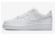
Air Force Ones

Provide pictures of different shoes and shoe brands that students would recognize. Practice composing an 8-beat word chain. Split students into small groups and have them compose and perform for the class.